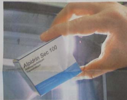
Fig. 3: Scanning or shooting of a pharmaceutical packaging protected by Cryptoglyph

ratios and built-in conceptual redundancies. This software, based on image processing and